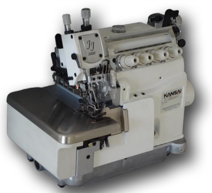
* The picture above is Upper feed version