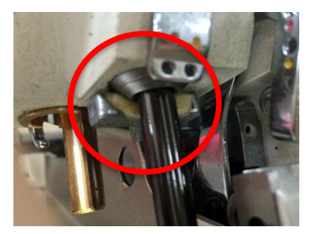
Needle bar oil suction system Protects the fabric from the oil stain

Closed type presser foot bar, needle bar and adapted DLC needle bar.